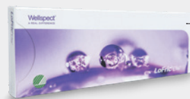
Sample pack, 5 catheters.

*Effective length, length of the catheter that can be inserted into the body.